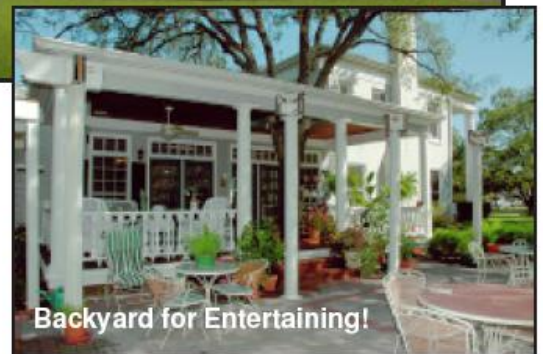
Backyard for Entertaining!